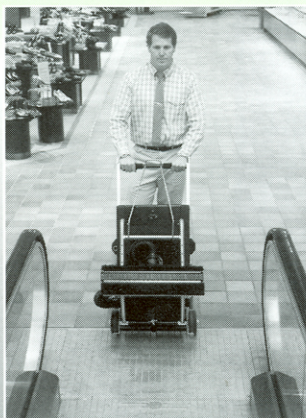
Ease of mobility adds to effortless cleaning and fast set-up and take-down.