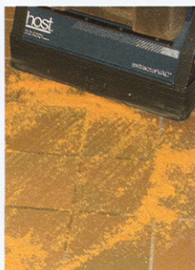
Use HOST SPONGES with the Liberator to clean grout