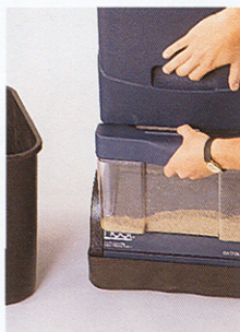
Clear, bagless hopper for quick and easy dumping