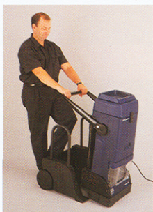
Brush drive makes it easy to load and unload from caddy