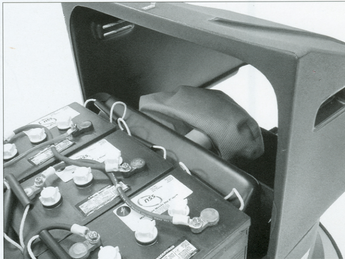
The Vac-Trac™ Dust Control System collects pad dust in a filter bag at the front of the machine (under the sliding battery compartment lid).