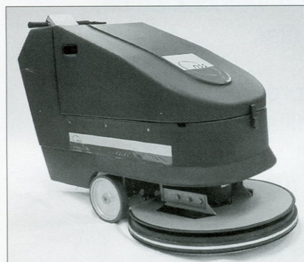
Using the tilt-lever at the rear of the machine, the Charger 2716 DB Plus can be tipped from its operating position...