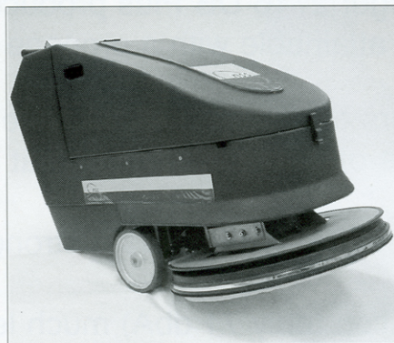
...to the transport position ...