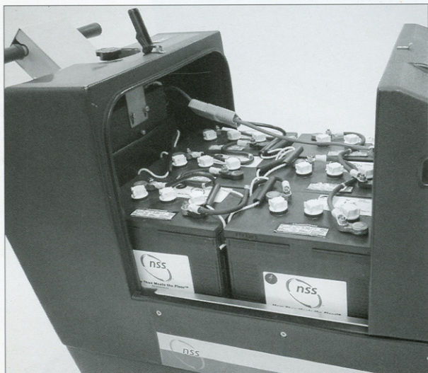
The six 6V, 325 AH batteries provide up to 4 hours of run time, increasing productivity.