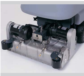
E24 Cylindrical Deck