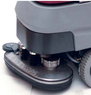
E26 Disc Deck

Low brush deck is ideal for cleaning underneath obstacles.