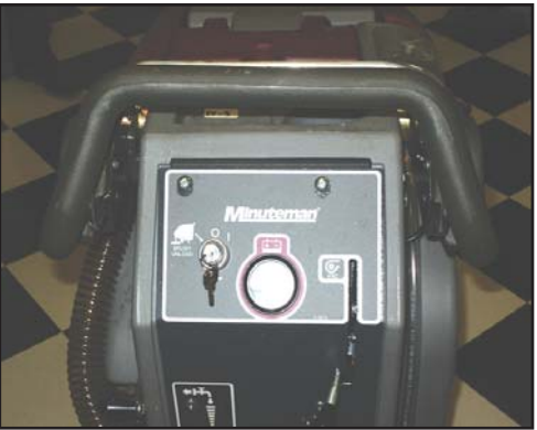
Simplified and easy-to-understand operator controls.