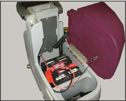
Easy access to the batteries and drive system for service and maintenance.