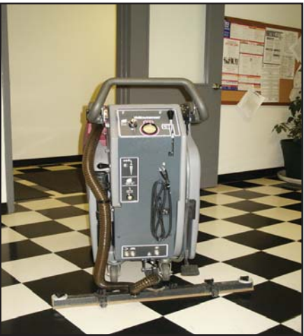
Squeegee with no adjustments necessary and a two sided blade